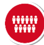
Number of employees: more than 800